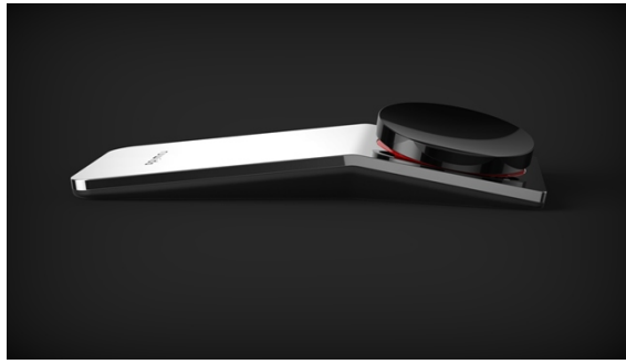
organic haptic feedback mechanism